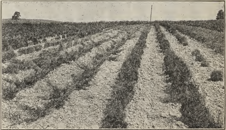
This is a block of Evergreens showing Arbor Vitae, Pyramidalis and Junipers Sabina.